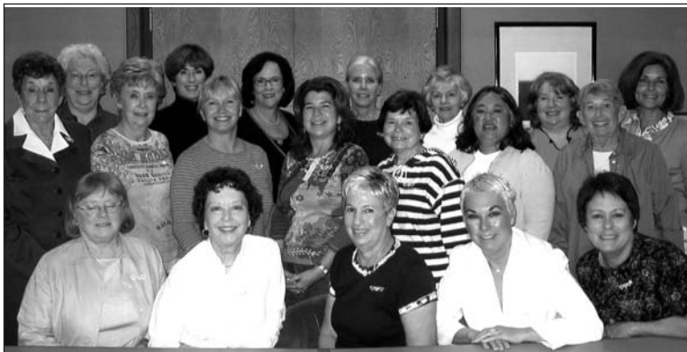
Assistance League of Long Beach 2006-2007 Board

We would like to extend a heartfelt "thank you" to our many wonderful and dedicated volunteers.