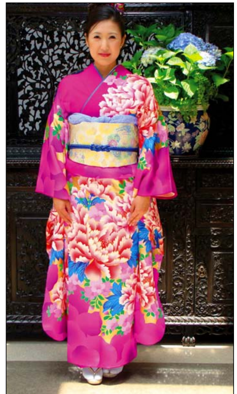
Kimonos were modeled by Kimono Club members.