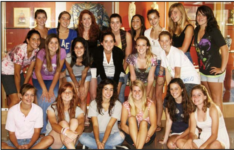
Assisteens' Elected Officers 2008-2009